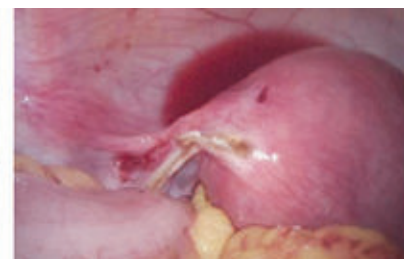
Fig.-5: After salpingectomy