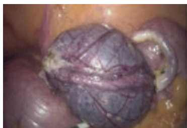
Fig.-1: Paraovarian cyst & appendix

maintained in a 30 0 trendelenburg position. 2D image system used in 30 patients & 3D image system used in 12 patients. Reduction of the cysts size done by aspiration of contents. Dissection was carried out with hook, scissors & ligasure advanced bipolar system. Difficult procedures like residual tumor, chocolate cysts etc were well managed using three dimensional(3D) image system & ligasure advanced bipolar system. Associated recurrent appendicitis were present 12 cases & cholelithiasis with chronic cholecystitis were present in 4 cases. Laparoscopic appendectomy performed using same ports & for laparoscopic cholecystectomy 2 extra 5mm ports were needed. Operating time for these associated procedures were not included in this study. Specimen were placed in endobag, divided into pieces with scissors where necessary & removed through supraumbilical 10 mm port using 5 mm laparoscope in the right 5mm ancillary port. Most of the specimen sent for histopathological examination. 10 mm port closed using port closure technique. Assessment of indications, intraoperative findings & various interventions done during the procedure were carefully analyzed. The patients were kept nil by mouth for 12 to 24 hours depending on the condition & discharged on 3 rd postoperative day. All the cases were followed up after 1wk, 4wk & 8wk.