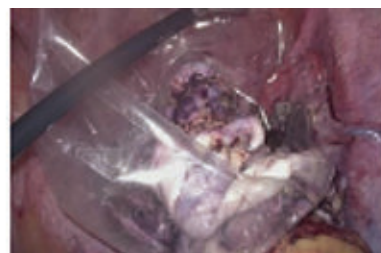
Fig.-3: Endobag containing dermoid cyst