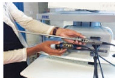
Fig.-6: 3D & 2D camera(Personal set-up)