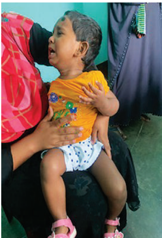
Fig.-3 A 2 year old baby of Aicardi-Goutieres Syndrome, patient is irritable, no microcephaly, upper motor neuron lesion present in both upper and lower limb