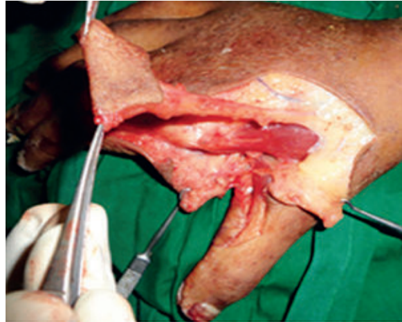
Fig.-6: FDMA flap harvesting