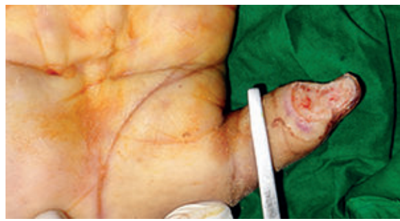
Fig.-4: Acquired volar defect of thumb