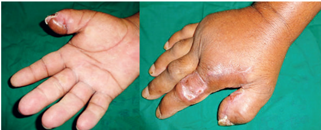
Fig 8: Follow up at 6 months