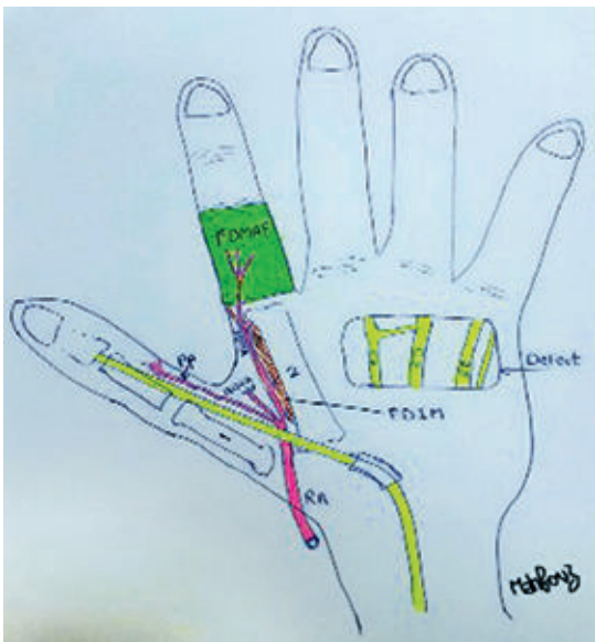
Fig.-1: Diagrammatic Anatomy

The fascia is cut and the periosteum is then stripped off the second metacarpal bone on the radial side. The nutrient branch to the metacarpal head is identified and tied up. The flap is elevated, leaving the paratenon intact. The pedicle includes the fascia of the first dorsal interosseous muscle, the dorsal veins and the sensory branch of radial nerve. Then the flap is placed over the defect. The donor area is covered by FTSG. A lot of attention should be taken to the pedicle positioning in order to prevent strangulation.