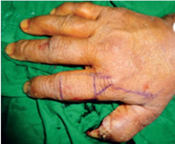
Fig.-5: FDMA flap design