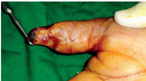
Fig.-3: Initial soft tissue defect