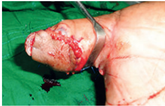
Fig.-7: Flap insetting