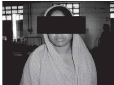
Fig.-1: Patient (Printed with permission)

She was treated with acetazolamide 250 mg twice daily, prednisolone 60 mg for 2 weeks, and repeated therapeutic lumbar puncture. Her headache subsided, and vision improved. She was discharged with acetazolamide and was asked to come to hospital for 2 weekly follow up. She was doing well when last seen.