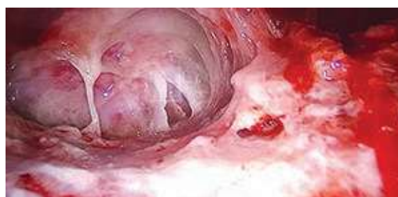
Figure 3: View of pleura cavity during VATS.

connected with water seal drainage bag followed by proper suturing of the wound. Watchful observation was done to detect any complications and all procedure related data were recorded. The criteria for success were similar to that of group A and the treatment was considered failure if the patient needed a thoracotomy later. The endpoint was the same. Chi square test was done for the calculation of continuous and categorical variables. Outcome variables in between groups were measured by Fisher's exact test. Statistical package for the social science (SPSS) version 23.0 was used for statistical analysis of data. A p value <0.05 was considered statistically significant.