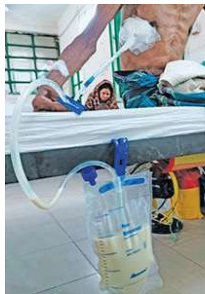
Figure 2: ICD for empyema thoracis.