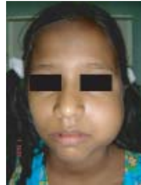
Fig-4: Photograph shows clinically evident expansile swelling (ameloblastoma) in left mandible

Case – 1b: Clinical achievement of normal facial contour by “Dredging Method” in a 10 years old girl.