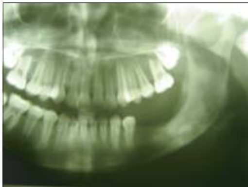
Fig-2: Orthopantomogram shows bone formation in left ramus and body of mandible 2 months after enucleation