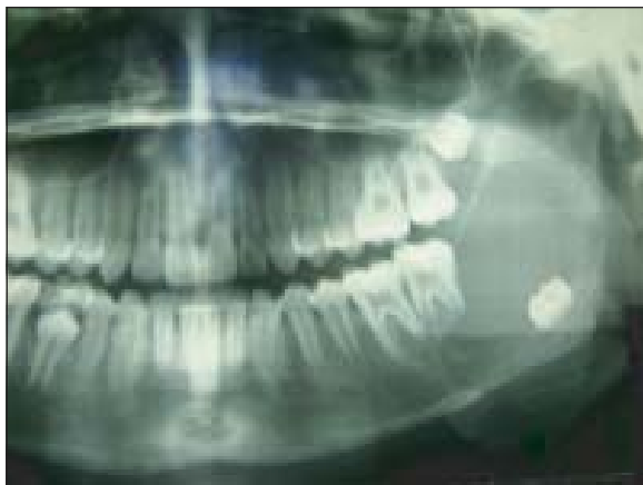
Fig.-7: Cystic lesion in left ramus of mandible

Case-2: Orthopantomograms show gradual bone formation and achievement of normal mandibular contour in sequential steps of “Dredging Method” in a 13 years old boy.