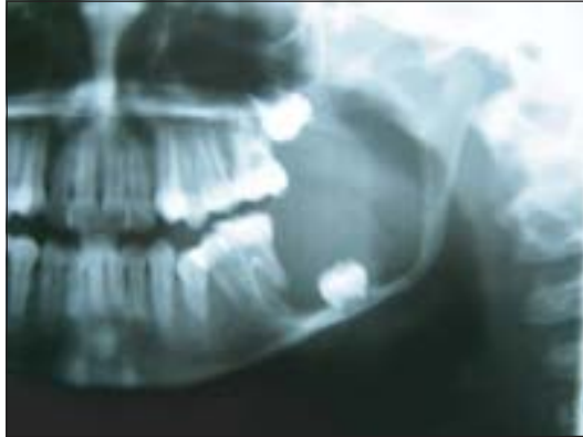
Fig-1: Orthopantomogram shows unicyclic lesion in left ramus and adjacent body of mandible

Case – 1a: Radiographs show gradual bone formation and achievement of normal mandibular contour in sequential steps of “Dredging Method” in a 10 years old girl