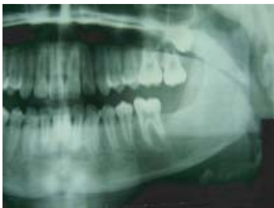
Fig.-9: Normal cortical outline with no evidence of recurrence in 20 months follow up