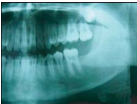
Fig.-8: Bone formation in ramus 6 months after enucleation