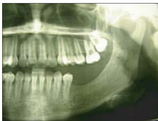
Fig-3: Orthopantomogram shows normal bone contour with cortical outline without evidence of recurrence 6 months after 2 nd dredging (12 months after enucleation)

Case – 1b: Clinical achievement of normal facial contour by “Dredging Method” in a 10 years old girl.