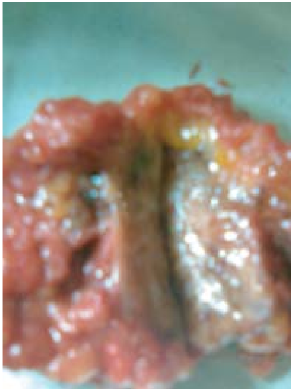
Fig-1: Gross appearance of the lesion (after surgical excision)