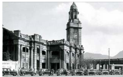
Figure -6: Former Tsim Sha Tsui Kowloon-Canton Railway Terminus