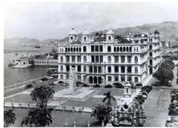
Figure -5: Old Hong Kong Club