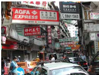
Figure -3: Former Lee Tung Street

The demolition of the old Star Ferry Pier in December 2006 and the young activist movement it triggered for preserving the pier with its "collective memory" suddenly brought the issue of heritage conservation sharp into focus. Heritage conservation issue was energized and different stake holders and public started to hope for a concrete benchmark. Seeking re-election in March 2007, the Chief Executive (CE) Donald Tsang declared his position in heritage conservation and later honoured his promise in October 2007 with a package of measures for heritage conservation finally put in place.