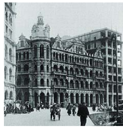
Figure -4: Former General Post Office