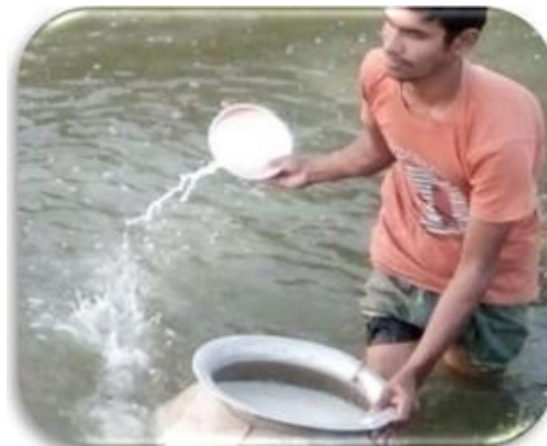
Fig. 3: Application of lime.

Pond preparation: Before releasing fry, aquatic weed was removed manually and the pond treated with rotenone to a rate of 4.94 kg/ft/ha to remove unwanted fish. After 7 days interval lime was applied at a rate of 250 kg/ha. At first, lime was mixed with water in an aluminum pot then applied by spreading method. Pond was fertilized with cow dung, urea and TSP at a rate of 1200, 25 and 13 kg/ha respectively. A seven days interval was maintained between lime and fertilizer application. As catfish fry are susceptible to viral infection, the research pond was treated with Tansen at a rate of 4.94 kg/ha before releasing fry.