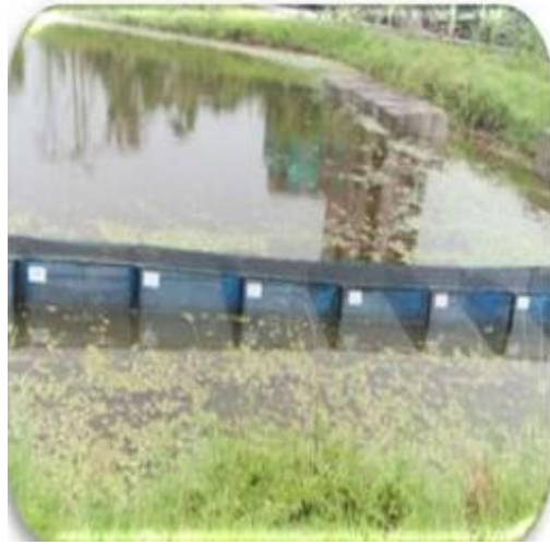
Fig 2: Experimental hapa.

Hapa preparation: A total of eight hapas were prepared using mosquito net and rope where each hapa covering an area of about 1.2 × 0.9 × 0.9 m 3 which was rectangular in shape. Then it was set into a net cages made of iron to prevent the damage of hapa due to crab attack.