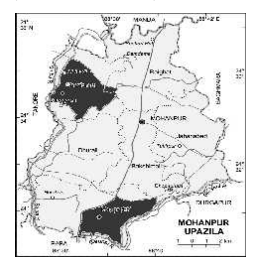
Fig. 1. Study areas in Mohanpur upazila

The study was conducted on two beels which are situated in Mohanpurupazila of Bangladesh. Mohanpur is a - upazila under Rajshahi district. It is situated between 24° 28' and 24° 38' North latitude and between 88° 34' and 88° 43' east latitude having an area of 162.65 sq km (figure 1).