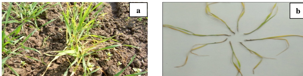
Fig. 1(a-b): Seedling status and plant growth by adding probiotic and organic manures for soil amendments, a) seedling infection and, b) seedling blight.

Under this study, recorded results showed that there was a significant variation among the treatments. The highest inhibition effect against seedling blight (0.87%) was observed by treatment T 5 and the lowest (4.74%) from control (T 0 ) during 2018-2019 (Fig.1 a-b). Next to treatment T 5 , the treatment T 7 also showed remarkable effect in reducing seedling blight (1.07%) which was statistically identical (1.09%) with T 4 (Table 1).