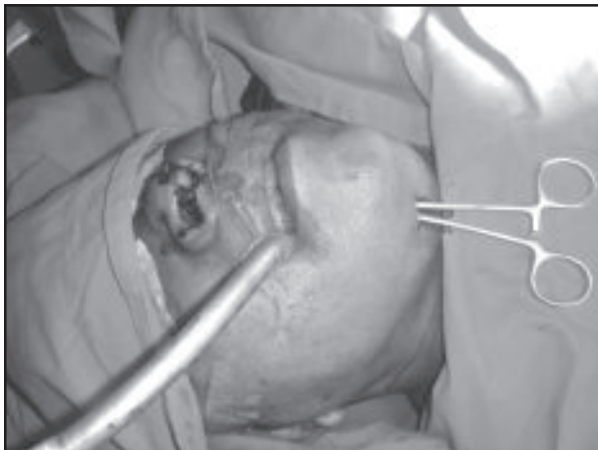
Fig 1 Oral intubation and blunt dissection