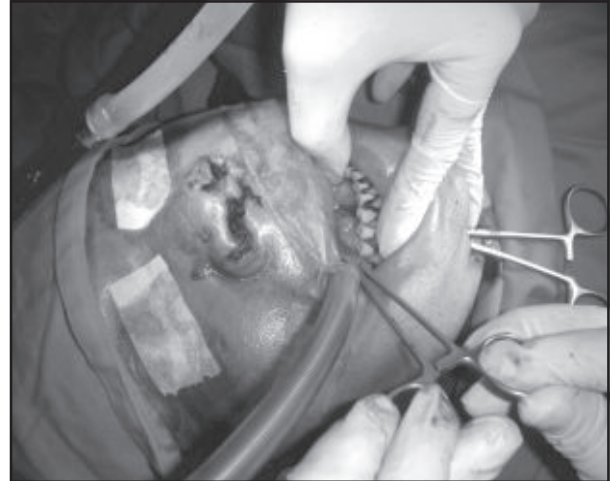
Fig 2 Artery forcep in oral cavity