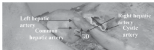
Figure 2: Photograph of the visceral surface of a liver, showing the cystic artery arising from the gastroduodenal (GD) artery