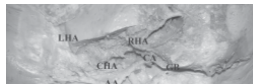
Figure 5: Photograph of the visceral surface of a liver, showing Cystic artery (CA) arising from junction between right (RHA) and left hepatic artery (LHA). Here AA=abdominal aorta, CHA=Common hepatic artery, GB=Gall bladder.

from the right hepatic artery and 6 (10%) from other sources that was 2 from the left hepatic artery (3%), 2 from the junction between right and left hepatic (3%), 1 from hepatic artery