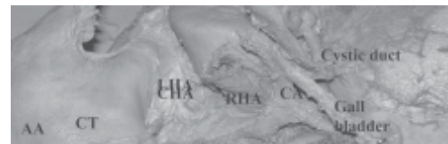
Figure 4: Photograph of the visceral surface of a liver, showing cystic artery (CA) arising from the right hepatic artery (RHA). Here AA = Abdominal aorta, CT = celiac trunk, LHA = Left hepatic artery, CHA = Common hepatic artery