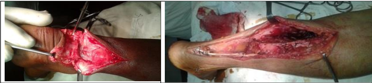
Figure I & II: Operative Procedure