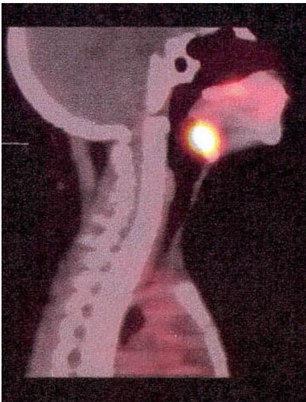
Figure I: Thyroid scan showing the Lingual Thyroid

A 14 year old female referred to the Centre for Nuclear Medicine & Ultrasound at Mitford Hospital, Dhaka with the complaint of change of voice & weight gain. The patient was also complaint of sleepiness and constipation. Interestingly the patient didn't give any history of dyspnoea or dysphasia. The routine laboratory investigations were reported as normocytic normochromic anaemia (Hb% 11.8 mg/dl). On examination the patient was a short stuttered female according to the age and skin was rough. During evaluation of thyroid hormones FT3 level was normal (4.7 pmol/ml); FT4 level was in lower limit (10.0 pmol/ml) and thyroid stimulating hormone (TSH) level was elevated (55.3 mIU/dl). Later on the patient was diagnosed as a case of hypothyroidism.