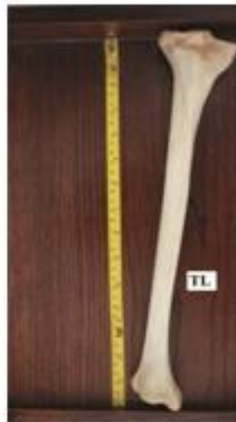
Figure I: Photograph showing total length of tibia by osteometric board; TL= total length

This analytical type of cross-sectional study was conducted in the Department of Anatomy at Sir Salimullah Medical College, Dhaka, Bangladesh from July 2014 to June 2015 for a period of one years. Dry left sided adult human tibia of unknown sex were collected from the Department of Anatomy and also from the students of Sir Salimullah Medical College (SSMC), Dhaka, Ibrahim Medical College (IMC), Dhaka, Dhaka National Medical College (DNMC), Dhaka and Bangladesh Medical College (BMC), Dhaka. Then the sex was determined by linear discriminant function analysis technique 8 . This linear discriminant function analysis technique was applied to the collected data in as follows: Z = b_0 + b_1 x_1 ; Here Z = Discriminant function, b_0 = Constant*, b_1 = Co- efficient* and x_1 = Total length of left tibia (independent variable).