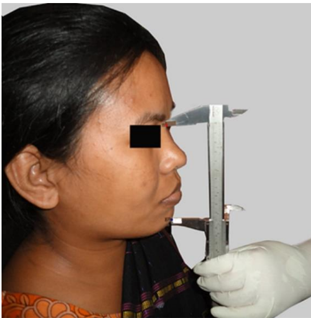
Figure I: Procedure for measuring facial height from ‘nasion to gnathion’ (n-gn) using vernier caliper, n-(red dot) indicates nasion, gn-(blue dot) indicates gnathion