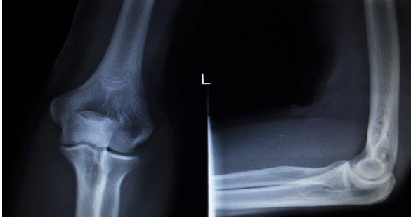
Figure III: Both view x-ray of elbow of the patient after 24 months of surgery

Although the V-Y triceps plasty is simple and reduction is easy to perform, this procedure has its disadvantages 2,21 . It leads to more pain after surgery, an extension deficit 4,18,21 and less available strength for manual work. There was a statistically significant relationship between the degree of preoperative flexion and the need for a triceps plasty (p ).