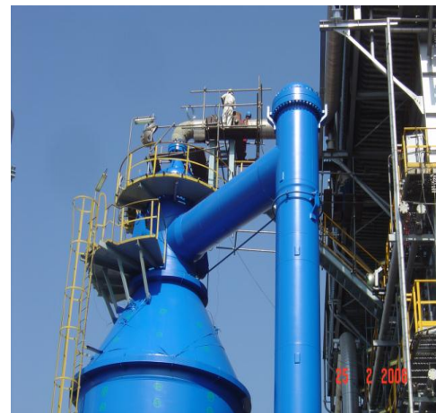
Figure 5 : Conical Portion of the 2RF