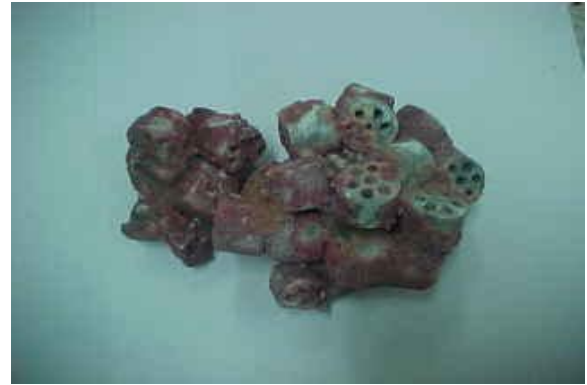
Figure 10: Catalyst with lump