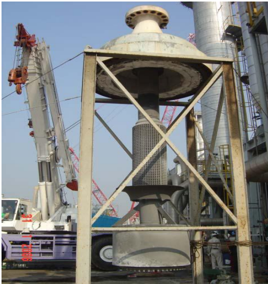
Figure 7: H 2 Burner within the 2RF