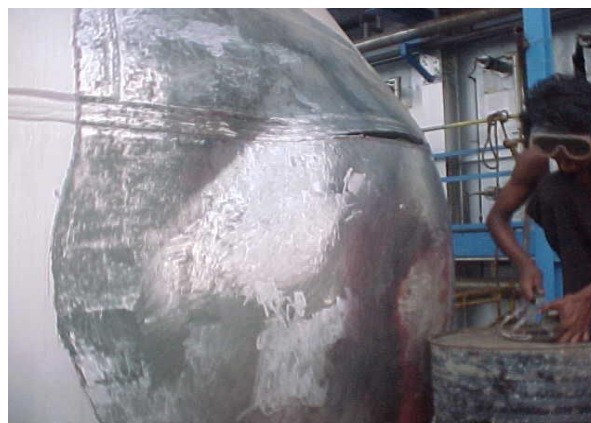
Figure 1: Bulging of 2RF Shell

The refractory on top conical part in the bulged area has been shifted outward (toward burner); appeared a number of long cracks in and around Damaged area ranging in width from 10-20 mm.