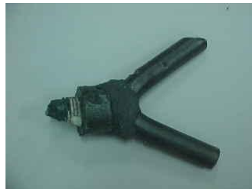
Figure 6 : Anchors