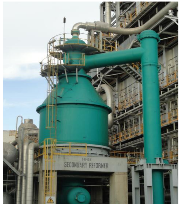
Figure 12 Metallic Shell of 2RF with temperature sensitive paint