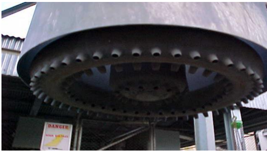
Figure 8: Tip of the Burners