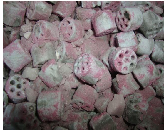
Figure 11: Catalyst with Dust and ruby colour