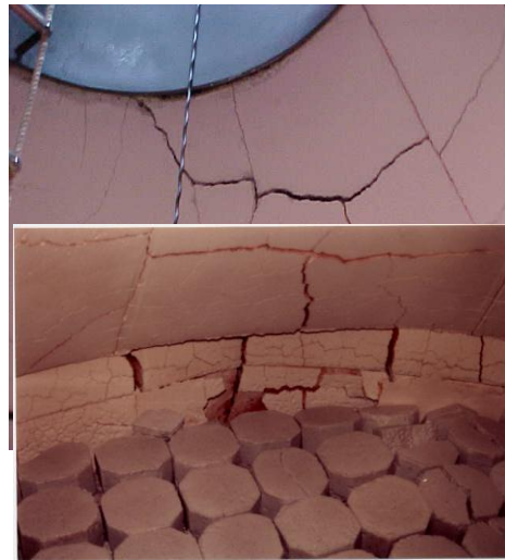
Figure 4: Castables inside 2RF