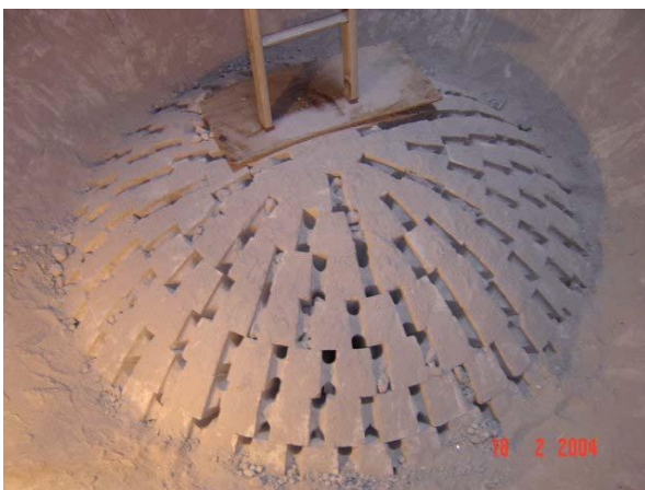
Figure 9: Bottom Dome within 2RF