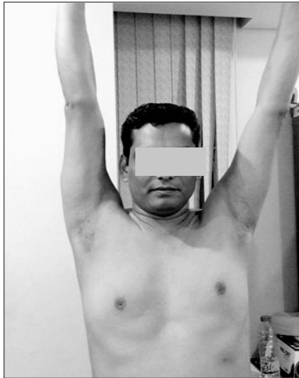
Fig 4 : Post-operative follow up 01 year later

Case 2: (Non union at follow up of 06 months later by conservative treatment)