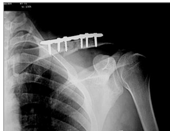
Fig 3 : Immediate postoperative X-ray showing plate osteosynthesis with anatomical precontoured 3.5-mm dynamic compression plate