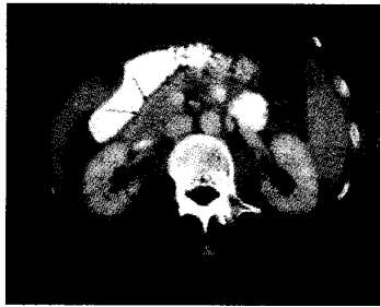
Fig 2 : Showing CT of the abdomen detecting a mass in the duodenum