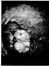
Fig 1 : Showing single nodular mass in the third part of the duodenum

disease 10 . The fistula often results in diarrhoea and vomiting with dramatic weight loss. Upper abdominal pain is usually present as is general malaise both from the presence of the disease and from the metabolic sequelae it causes 10-13 . The diarrhoea relates to colonic bacterial contamination of the upper intestines rather than to a pure mechanical effect 14 . It has also been suggested that duodenal bile salts have an irritating effects on colonic mucosa resulting in diarrhoea 15 . Vomiting may be faeculent or truly faecal with foul smelling eructation; but in some case reports this 'classic' symptomatology was often absent despite a fistula being present and patent enough to allow barium through it 16 . Occasionally patients will present with a gastro-intestinal bleeding.