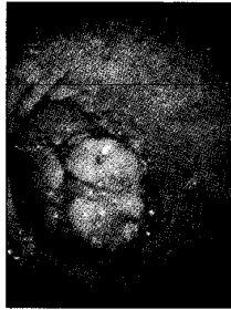
Fig 1 : Showing single nodular mass in the third part of the duodenum

Biopsy revealed a duodenal tissue showing dysplastic changes in gland epithelial cells and evidence of overt malignancy was absent, an abdominal CT scan revealed a nodular mass (Fig-2). Operative findings were that the tumor was in the posterior wall of the third part of duodenum. Duodenum was kokerized, duodenotomy performed, growth removed along with the attached duodenal wall. Duodenal wall closed in layer. No regional or metastasis enlarged lymph node was noted. Liver, hepatoduodenal ligament was found normal. The resected margins were free. Histopathology of the resected specimen revealed a well differentiated papillary adenocarcinoma (Fig-3). He had an uneventful postoperative course. He has been followed up for 2 years and remains recurrence free.