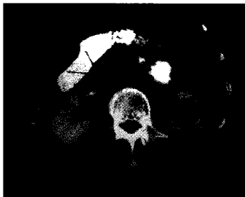
Fig 2 : Showing CT of the abdomen detecting a mass in the duodenum