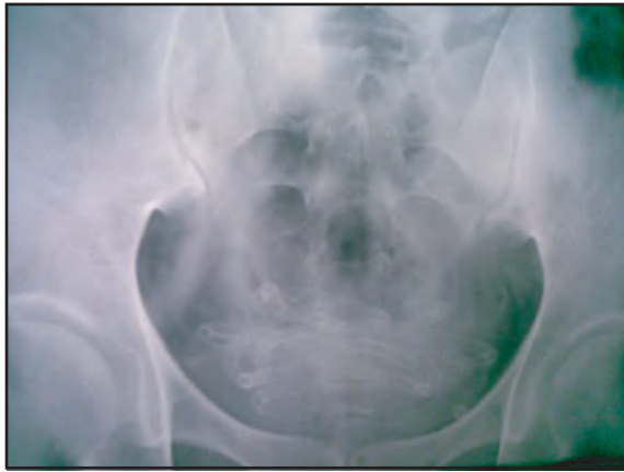
Fig 1 : X-ray shows PVC pipe coiled in urinary bladder

Endoscopic removal is associated with minimal morbidity and hospital stay. Sometimes open surgical procedure may require removing the foreign body. With the advent of a variety of modern endoscopic instruments, open surgery is rarely required [1].