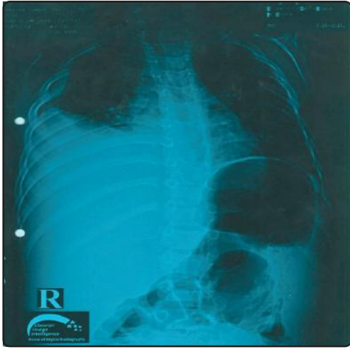
Fig 1 : Pleural effusion (Right side)

albumin (+), pus cells 3-5/ HPF, and urine bilirubin was not done. Anti HAV IgM antibodies was detected (Cut off value= 0.157, sample rate= 0.801). Hepatitis B virus surface antigen and anti hepatitis C virus were negative. Chest radiograph showed right sided pleural effusion (Fig 1). Abdominal ultrasound revealed mild hepatomegaly with normal parenchyma echogenicity, no ascites but right sided pleural effusion. The boy was treated symptomatically and chest X-ray on the tenth day of hospitalization demonstrated the pleural effusion was resolved completely (Fig 2).