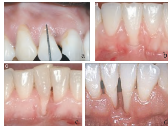
Fig 2: Different types of Gum Recession (a-Miller’s Class-i, b- Miller’s Class-ii, c- Miller’s Class-iii, d- Miller’s Class-iv)