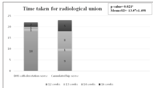
Figure 1 Distribution of the patients regarding time taken for radiological union and type of operation (n=45)