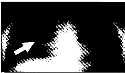
Fig 2: Clearance of opacification of right lung (arrow) after treatment