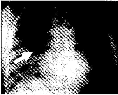
Fig 1 : Consolidation in right lower zone of chest (arrow)