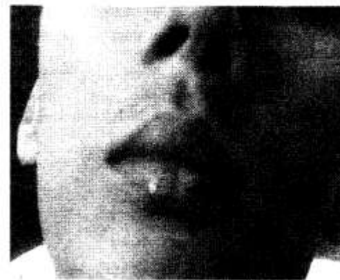
Fig 2 : Chin nodule