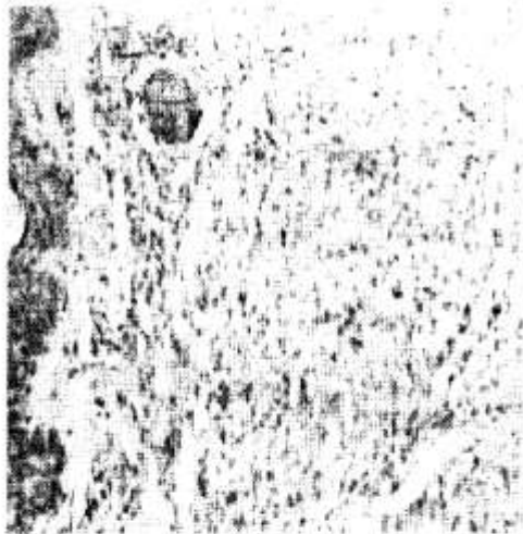
Fig 4: Histopathology of Chin nodule showing non-caseating granuloma