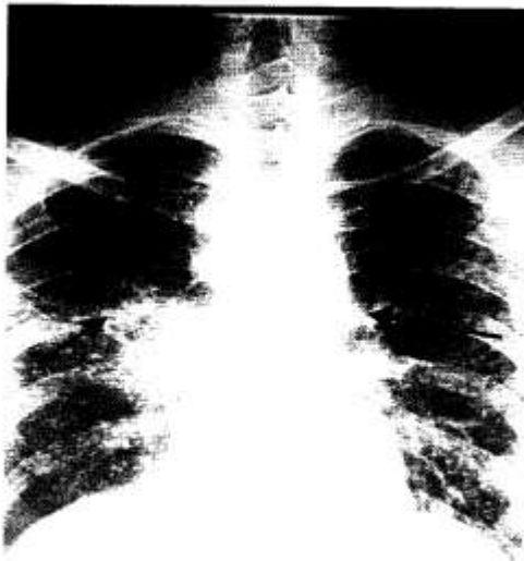
Fig 3: CXR P/A view showing bilateral extensive patchy opacity