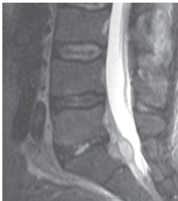
Fig. 2: MRI showing postoperative discitis with retrodiscal abscess.