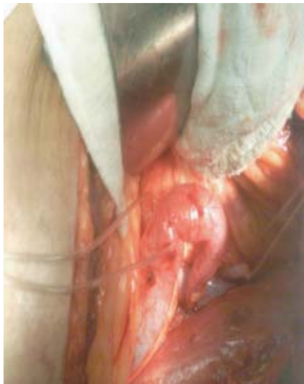
Fig.-3: Retrocaval ureter, peroperative view.

through flank approach with a JJ stent keeping in situ. Post operative recovery was excellent and JJ stent was removed after 4 weeks. First follow up after one month of JJ stent removal shows no pain, healthy surgical scar mark with no organism on culture of urine.