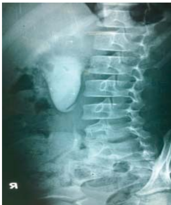
Figure 2. Type 1 retrocaval ureter on IVU.

After optimization, counselling and consent patient underwent retrogade pyelography followed by open surgical pyeloureterostomy