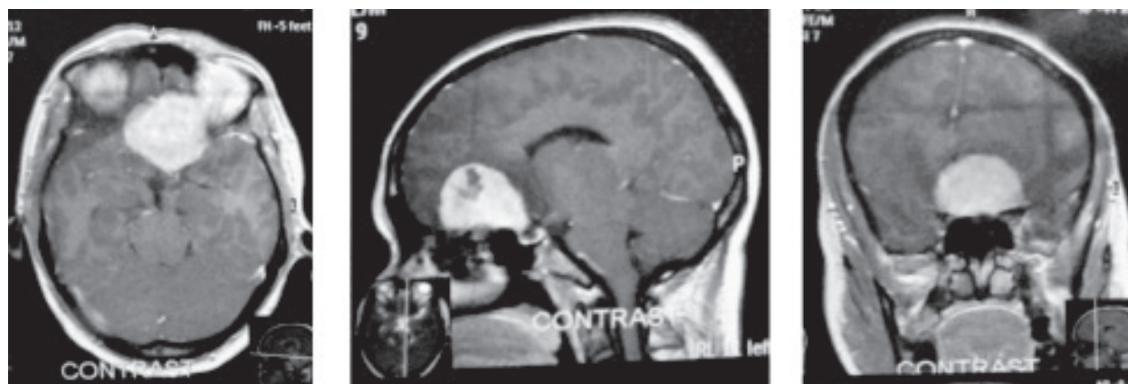
Fig.-1 : Preoperative postcontrast axial, sagittal and coronal MRI scan of Olfactory Groove Meningioma.

Contra lateral pre op and post op olfactory function