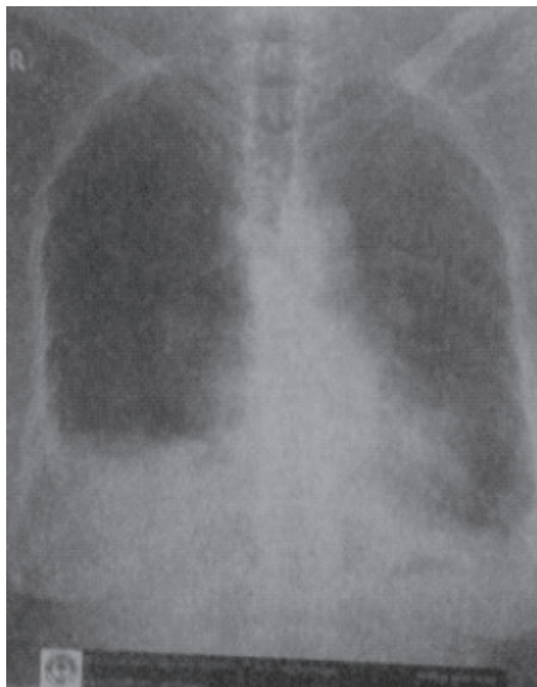
Fig.-1: Right Sided pleural effusion.

Laparotomy was done by right paramedian incision, clear ascitic fluid about 2 litres was drained out. There was a solid right ovarian tumour of 14 cm × 16 cm with intact capsule and left ovary and uterus found normal. No metastatic deposit in omentum, peritoneum and surface of other abdominal organs. Lymph nodes were not palpable. Total abdominal hysterectomy with bilateral salpingoophorectomy with infracolicomentectomy was done.