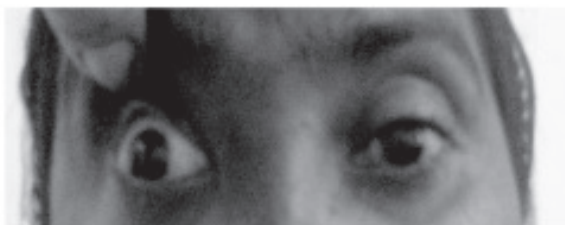
B. Before Treatment