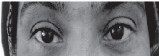
C. After Treatment