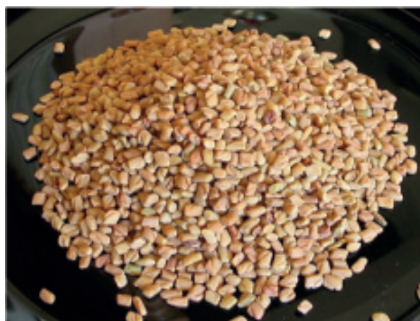
Fig.-3 : Fenugreek Seed (Methi)