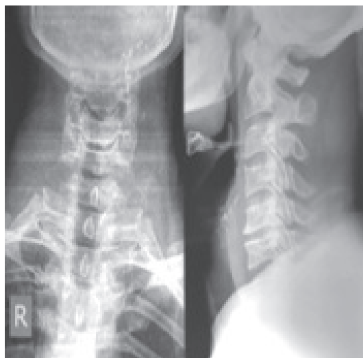
Figure: Pre-op radiograph of cervical disc herniation @ C4-C5