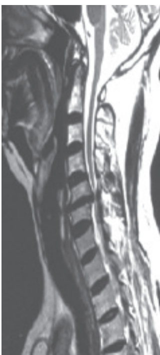
Figure: Pre-op MRI of cervical spondylosis @ C5-C6