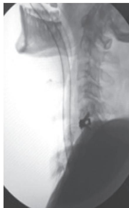
Figure: Post-op radiograph after ACDF @ C5-C6