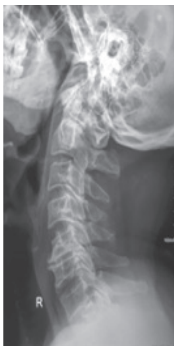
Figure: Pre-op radiograph of cervical spondylosis @ C5-C6

This study performed a comparative study of patients undergoing one level anterior cervical discectomy without fusion versus anterior cervical discectomy with fusion. The study included fifty patients operated at either C4-C5, C5-C6 level or at the C6-C7 level: a group of anterior cervical discectomy without fusion performed at one level on 25 patients was matched to a second group of 25 patients with single-level of anterior cervical discectomy with fusion, based on level, age and sex.