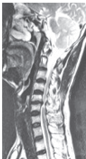
Figure: Pre-op MRI of cervical disc herniation @ C4-C5