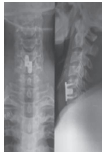
Figure: Post-op radiograph after ACDF @ C4-C5