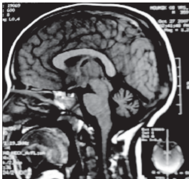
Fig.-1: MRI of brain showing Cerebellar atrophy with trifoliate appearance.

Dhaka, on 26.01.2010 with the complaints of generalized weakness and difficulty to walk from the 6th year. The patient initially could try to walk but later on she fell on the ground as she developed imbalance in walking that gradually involved also in standing capacity within one month.