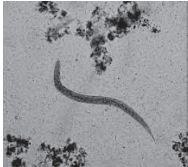
Fig.-2: Routine microscopic examination of stool showing larvae of Strongyloides stercoralis (black arrow).

Biopsy was taken from a gastric ulcer which revealed ulceration and dense infiltration of acute and chronic inflammatory cells along with extensive intestinal metaplasia. There were tiny helminthic bodies within the mucosal glands and on the surface consistent with Strongyloides stercoralis .