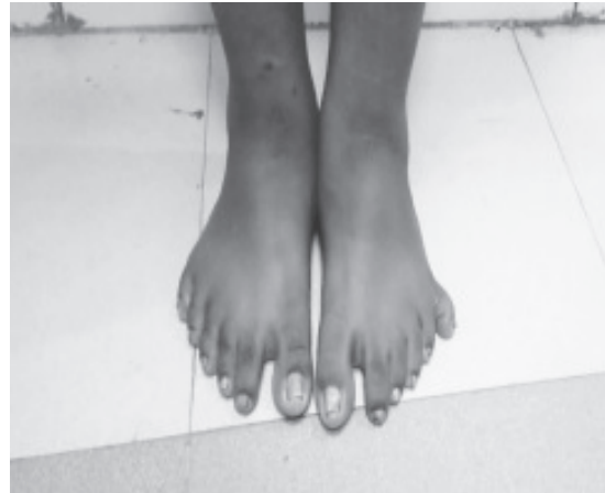
Fig.-2: Polydactyly on both feet

Acanthosis nigricans was found around the neck. His visual acuity was 6/60, and mixed astigmatism was present. Fundoscopic examinations revealed retinitis pigmentosa (both eyes). Other examinations revealed no abnormality.