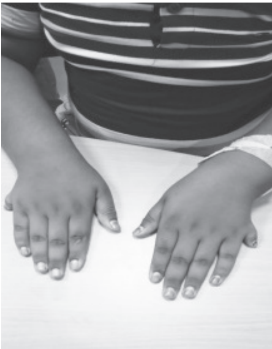
Fig.-1: Polydactyly on both hands

On examination, he had facial puffiness, depressed nasal bridge, hexadactyly in all four limbs, weight 75 kg, height- 155 cm, and Body mass index (BMI) 31.21 kg/m 2 , which was more than 95 percentiles according to his age. Stretched penile length (SPL) was 2.5 cm, testicular volume (TV) was 5 ml, and axillary and pubic hair was at the prepubertal stage.