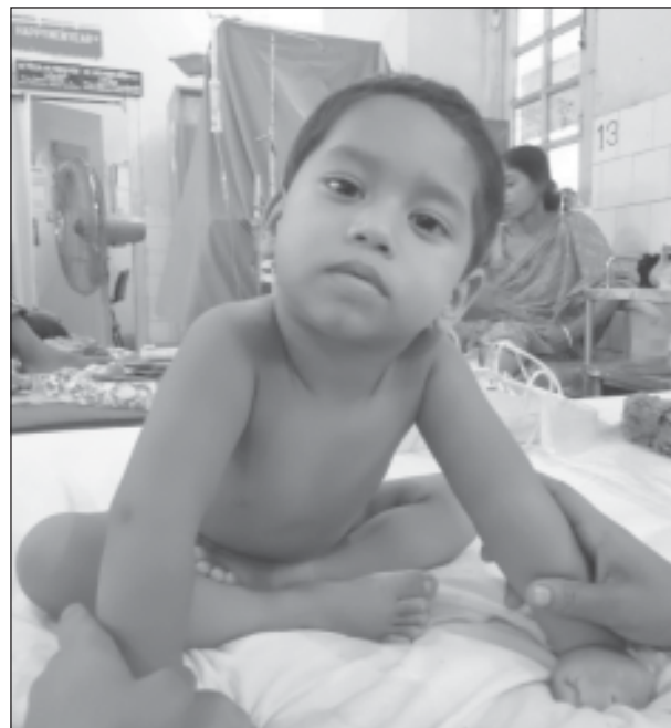
Fig.1: A 2 year 9 month child can sit only with support.

parents presented with delayed developmental milestones. He achieved his neck control at 4 months of age. She attained his sitting with support at the age of 2 years (Fig.1) and could not stand or walk. The child also developed