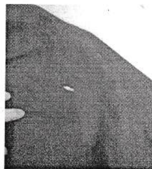
Fig-2: After extraction: Intranasal supernumerary tooth/Ectopic tooth.

Rest of the otorhinolaryngological examination was normal. Dental examination revealed that all the teeth were present. A diagnosis of supernumerary intranasal tooth was made and patient was taken up for extraction under General anesthesia.