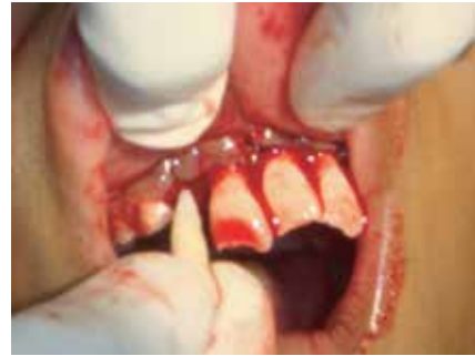
Fig 4. Procedure of re-implantation