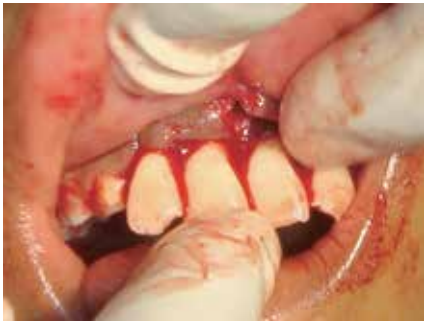
Fig 5. Re-implantation of teeth