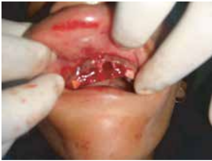
Fig 1. Absence of central and lateral incisors