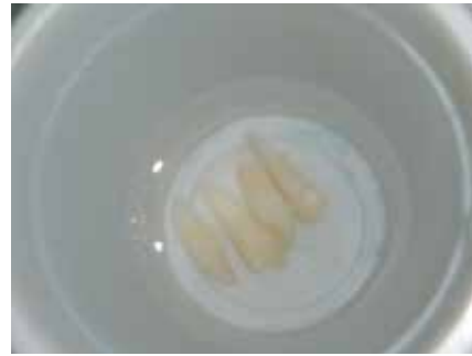
Fig 2. Avulsed teeth