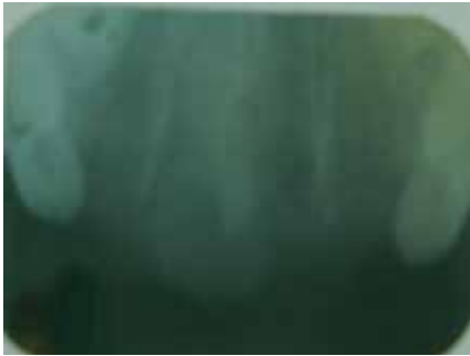
Fig 3. Empty bony sockets