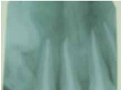
Fig 9. Periapical image after 12 months