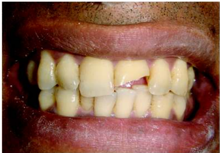
Fig 1. Initial photograph showing oblique coronal fracture

Then the shade was selected, the tooth was isolated with cotton roll and air dried. Uniform layer of 7 th generation self-etch adhesive bonding (beauty bond) was applied according to manufacturer's instruction. The adhesive layer was dried with gentle air blast for five seconds and light curing was done for 10 seconds. Then the crown was built up incrementally with Giomer (beautiful II-# A2). Each increment was light cured for 20 seconds. Then the tooth was finished and polished and occlusion was checked (Fig 5).