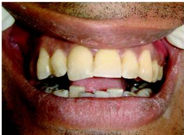
Fig 5. Final photograph after build-up