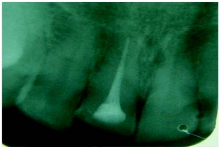
Fig 2. After root canal obturation