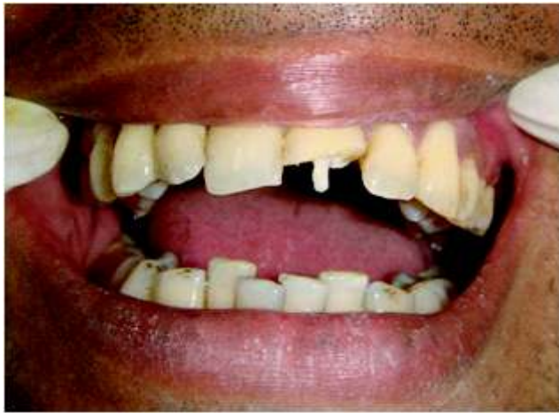
Fig 4. Placement of Glassix post