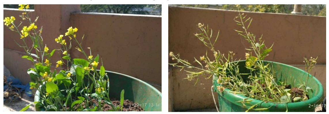
Figure 2: Growth of Indian mustard after 8<sup>th</sup> and 12<sup>th</sup> weeks