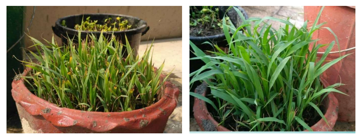
Figure 1: Growth of Napier grass after 8<sup>th</sup> and 12<sup>th</sup> weeks

Tannery sludge was collected from sludge dumping site of Apex Tannery Ltd, unit-2, Gazipur, Bangladesh. After collection, the sludge was dried to drive out extra moisture and the sample was prepared for seedling. Seeds of Indian mustard & Napier grass were collected from local market. Then the seed samples were sown in two different pots containing sludge sample. The seeds were grown through proper care and the plant samples were harvested after 8<sup>th</sup> and 12<sup>th</sup> weeks of plantation. The samples were then washed with distilled water and then sorted into three parts: roots, shoots, and leaves. After grinding and homogenization the samples were stored in refrigerated condition (4<sup>o</sup>C) in sealed container until the next analysis.