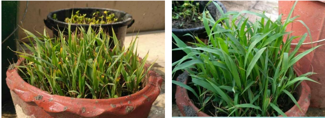
Figure 1: Growth of Napier grass after 8 th and 12 th weeks

Tannery sludge was collected from sludge dumping site of Apex Tannery Ltd, unit-2, Gazipur, Bangladesh. After collection, the sludge was dried to drive out extra moisture and the sample was prepared for seedling. Seeds of Indian mustard & Napier grass were collected from local market. Then the seed samples were sown in two different pots containing sludge sample. The seeds were grown through proper care and the plant samples were harvested after 8 th and 12 th weeks of plantation. The samples were then washed with distilled water and then sorted into three parts: roots, shoots, and leaves. After grinding and homogenization the samples were stored in refrigerated condition (4°C) in sealed container until the next analysis.