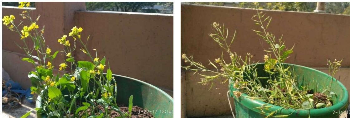
Figure 2: Growth of Indian mustard after 8 th and 12 th weeks