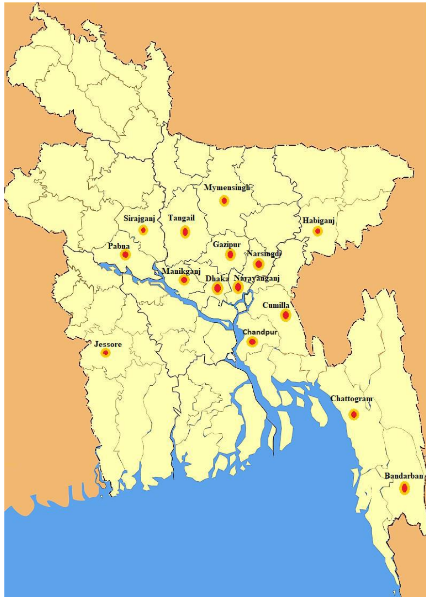
Figure 6: Locations of the inspected factories throughout the country

The map of Bangladesh in figure 6 is depicting the visual inspection locations spreading in 15 districts of the country. These locations also indicate the major industrial hubs of the RMG factories are concentrated near Dhaka, the capital city of the country.