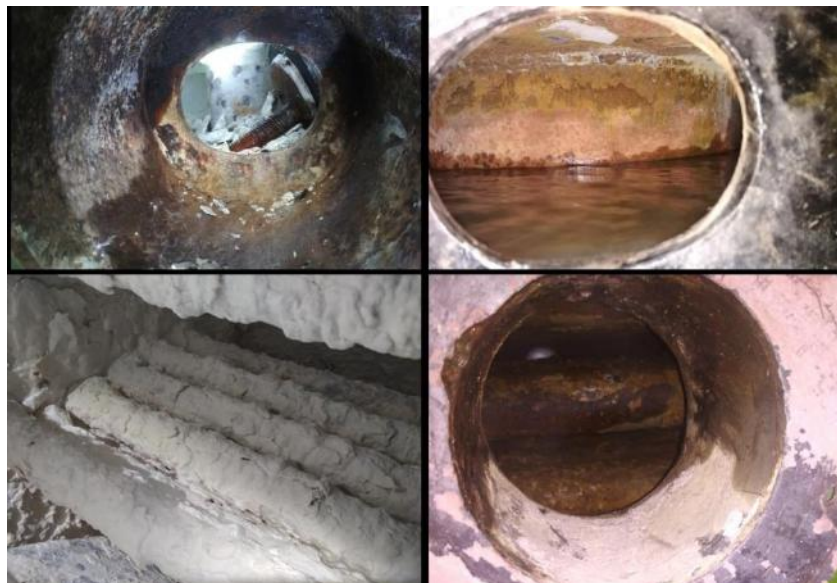
Figure 1: Corrosion of the metal and scale formation inside the boiler for using untreated water (Accord, 2019; Siraj et al. , 2023)

Fire, electrical and structural hazards were significantly minimized at more than 1600 Accord-listed RMG factories by continuous inspection, monitoring, and remediation suggestion by the Accord (Barua and Ansary, 2017; Wiersma, 2018). However, the death of 13 workers and several injuries due to a severe explosion of a boiler at Multifabs Clothing Factory in 2017 revealed a gap in the Accord inspection scope (“Boiler explosion”, 2017). Studies disclosed that boiler operations are associated with several critical hazards such as explosions, steam burns, chemical hazards, and so on which cannot be covered in a fire or electrical safety inspection scope (Hossan et al. , 2019; Siraj et al. , 2022; Yusof and Mohammad, 2022). Therefore, the Accord planned to initiate a boiler safety inspection department separately in 2018 to minimize boiler-related hazards in the RMG factories and conducted a pilot inspection program for 35 boilers in 17 factories (Accord, 2019). That pilot program had several critical findings such as the absence of water treatment facilities, boiling water and steam leakage, improper maintenance activity, leakage on the fuel line, improper insulation, faulty electrical wiring in the boiler panel, and so on. Figure 1 is presenting some of the critical risk factors observed in the Accord’s boiler safety pilot program.