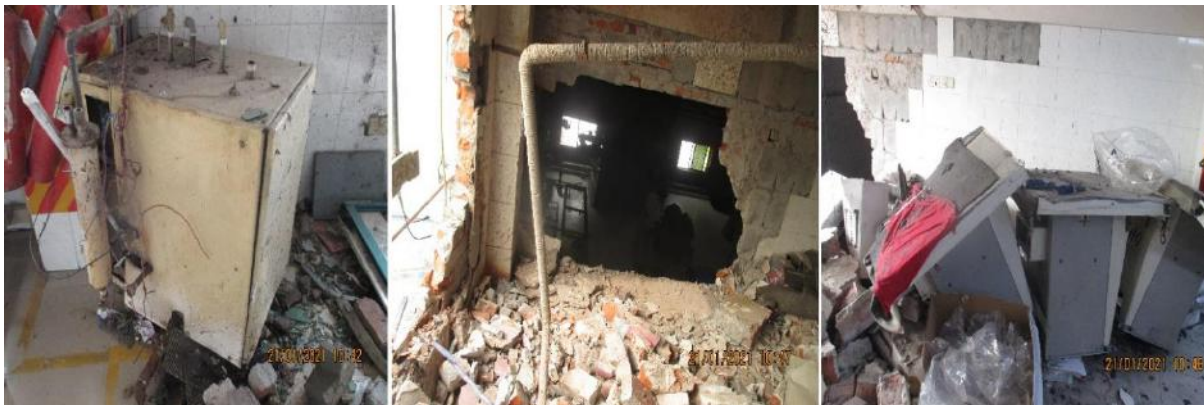
Figure 3: Mini-boiler (left), collapsed boiler room (middle), impact on the adjacent production floor (right); observed during the Incident inspection by the RSC at Sincere Composite Ltd.