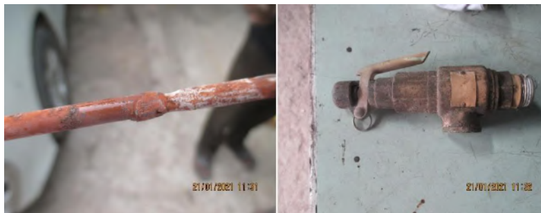
Figure 4: Lengthening the level sensor by welding (left), rusted stuck safety valve (right); observed during the Incident inspection by the RSC at Sincere Composite Ltd.

There are a lot of mini-boilers operated in the RMG factories in Bangladesh which are not defined as a boiler in the Boiler Law-2022. Against this backdrop, the RSC started to implement the boiler safety inspection program on March 2021 to ensure the standard practices for boiler operation in the RMG factories of Bangladesh to support its ongoing journey towards sustainability.