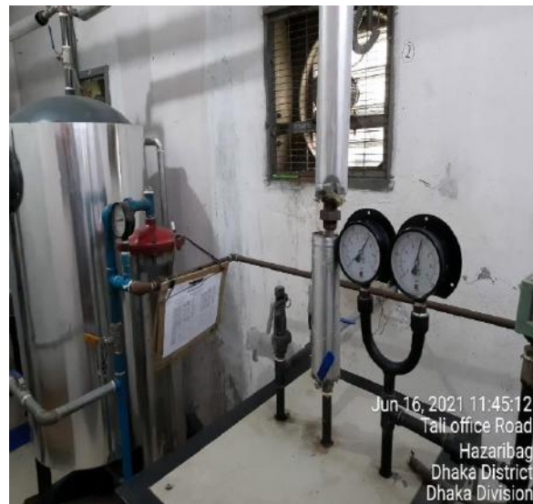
Figure 9: Different steam pressure at two gauges