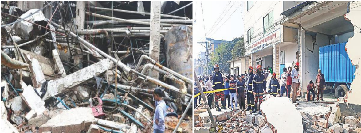
Figure 2: Boiler explosion at Multifabs Ltd on July 3, 2017 (Left) (“Boiler explosion”, 2017), and at Natural Sweater Village Ltd on December 10, 2019 (Right) (“One killed”, 2019)

Moreover, the mechanical safety valve got stuck due to irregular maintenance and rust formation. Figure 4 is showing the investigated causes of the mini-boiler explosion at Sincere Composite Ltd.