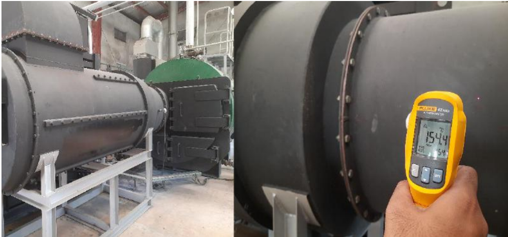
Figure 12: Uninsulated hot surface in the boiler room

The study introduces a method for visual inspection of industrial steam boilers, empowering managers to conduct inspections independently, fostering a sustainable workplace. Additionally, it proposes a categorization framework for steam boilers, aiding in selecting the appropriate type for a factory's specific needs. The research also identifies common risk factors in steam boiler operations, offering targeted remediation strategies for each. It also facilitates the development of a stratified action plan to mitigate these risks effectively, allowing for budget-friendly implementation without requiring substantial upfront investment.