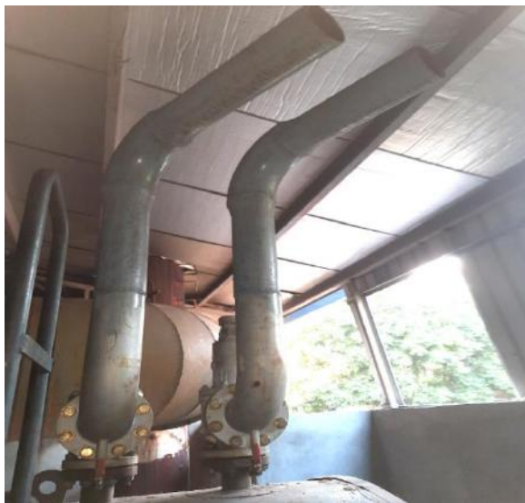
Figure 8: Safety valve discharge point inside the room

Industrial managers often need to work under pressure to meet production demand, minimizing the cost, and maximizing profit (Siraj et al. , 2022). This factor strongly influences the decision-making process, especially in an emerging industry of a developing country. Therefore, the outcomes of this study provide significant assistance in managerial decision-making within the RMG industry's boiler operations. It presents a comprehensive overview of boiler operations, enabling factories to assess their practices and position accordingly (Islam et al. , 2022).