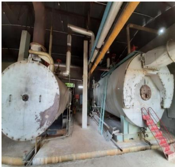
Figure 10: No railing for the service platform of boilers