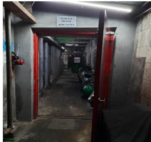
Figure 11: Inadequate clearance, obstructed ventilation