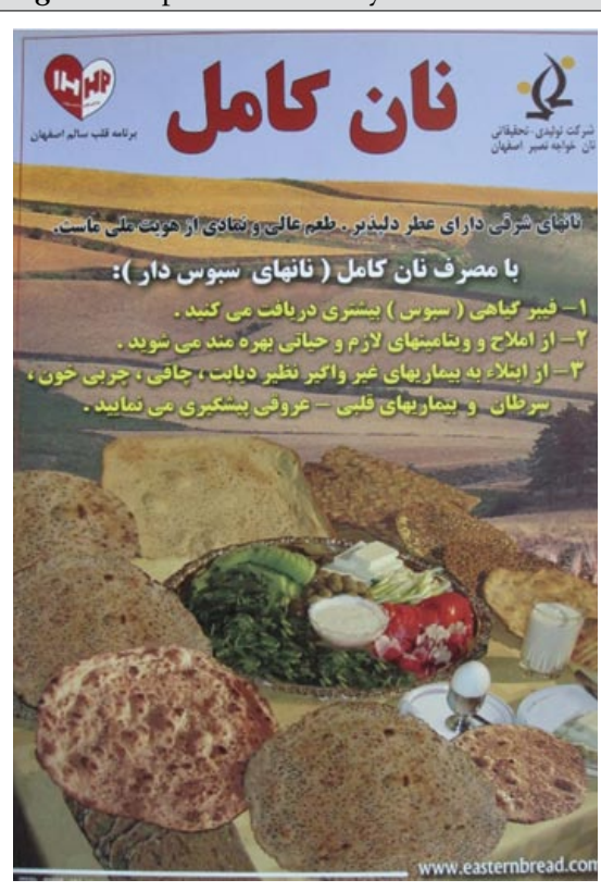
Figure 1. A poster of Healthy Bread Initiative

The opinion of people about the quality and wastage of HB and their satisfaction were assessed at the end of the study. A questionnaire was designed, and the validity of its content was confirmed by experts. Respondents were asked about three different aspects of the quality of bread, i.e. taste, brittleness, and persistence (durability). Those who reported better quality for at least 2 dimensions were assumed to believe that HB had overall better quality. The reliability of the questionnaire was