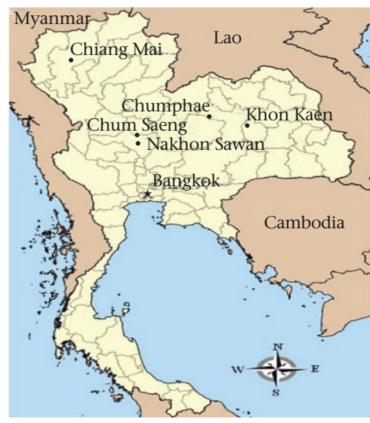
Fig. 1. Map of Thailand showing location of Chumphae district

versity, within 48 hours. The sera were kept at -20^{\circ}\text{C} until tested.