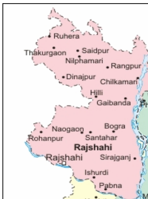
Plates 1-2. Map of Rajshahi Division that includes the study area (left); Map showing Northern Districts under study (right)

Study area: Seven Districts of the Northern region of Bangladesh under Rajshahi Division, namely Thakurgaon, Dinajpur, Nilphamari, Saidpur, Rangpur, Bogra and Rajshahi, were selected for the study (Plates 1 and 2). The main considerations in selecting the study area were as follows: (a) a large number of poultry farms are raised in the region; (b) no study of this nature was conducted previously; (c) the study areas are well-communicated; (d) satisfactory co-operation received from the farm owners; and (e) occasional outbreaks of bird flu (avian influenza, AI) and other poultry diseases in the area.