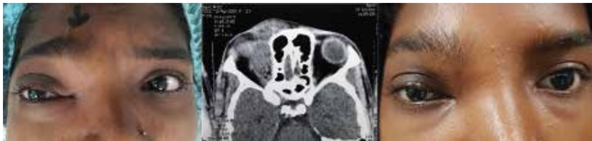
Figure 3 (a-c): a 10-year-old girl presented with right periocular lymphangioma, Axial CT images showing the heterogenous lesion within an internal septation involving the right upper eyelid and extraconal space of the right orbit. Post bleomycin injection resulted satisfactory outcome.

A study reported 13 patients with orbital lymphangiomas who underwent sclerotherapy injection with bleomycin with an average follow-up time of 19.69 months. 92% of patients showed more than 60% reduction in the maximal lesion diameter. 2 A study reported on 12 patients treated with bleomycin sclerotherapy, 50% showed complete resolution, and the other 50% showed more than 70% without any systemic and ophthalmic side effects. 15 Hill RH et al. described safe and effective treatment modalities with dual drug sclerotherapy intralesional sodium tetradecyl sulphate and ethanol for macrocystic lesions and injection doxycycline for treating microcystic lesions. 10 The efficacy of intralesional injection of OK-432 (Picibanil) was studied on 12 patients with orbital lymphangiomas, 89% of patients presented with regression of tumour size, and 87.5% of patients improved their vision, decreased pain or proptosis in an average of 64 months follow up. 28 The OK-432 intralesional injection is effective alternative sclerotherapy that may require one to four injections over a month to 12