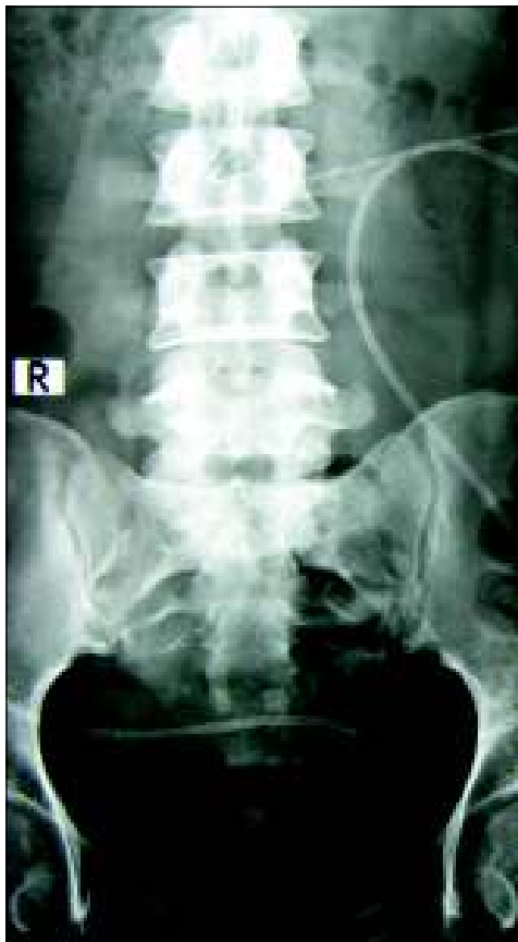
Fig.-3: Plain X-ray of lumbosacral region showing the lumboperitoneal shunt.

Lumbar puncture was done, in which, high CSF pressure was noted. Patient got relieved from her headache. But it reappeared soon. Then we put a lumbar drain for 5 days. But, when it was blocked, the headache reappeared. So, we decided to treat her with lumboperitoneal shunt. The shunt was inserted at the level of 4 th lumbar vertebra and secured with the lamina of that vertebra. The abdominal end was tunneled through the subcutaneous tract into the anterior abdominal wall. The peritoneal cavity was opened and the abdominal end was inserted. The wound was closed in layers. The patient, from the first postoperative day, was free from headache. She gradually regained her vision also. One-year follow-up revealed complete recovery from her IIH.